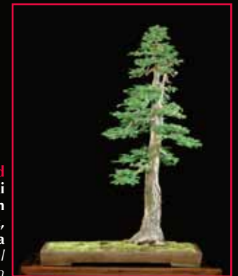
Coast Redwood Golden State Bonsai Federation Bonsai Garden At Lake Merritt, Oakland, California 2008 1 ST U. S. National Bonsai Exhibition