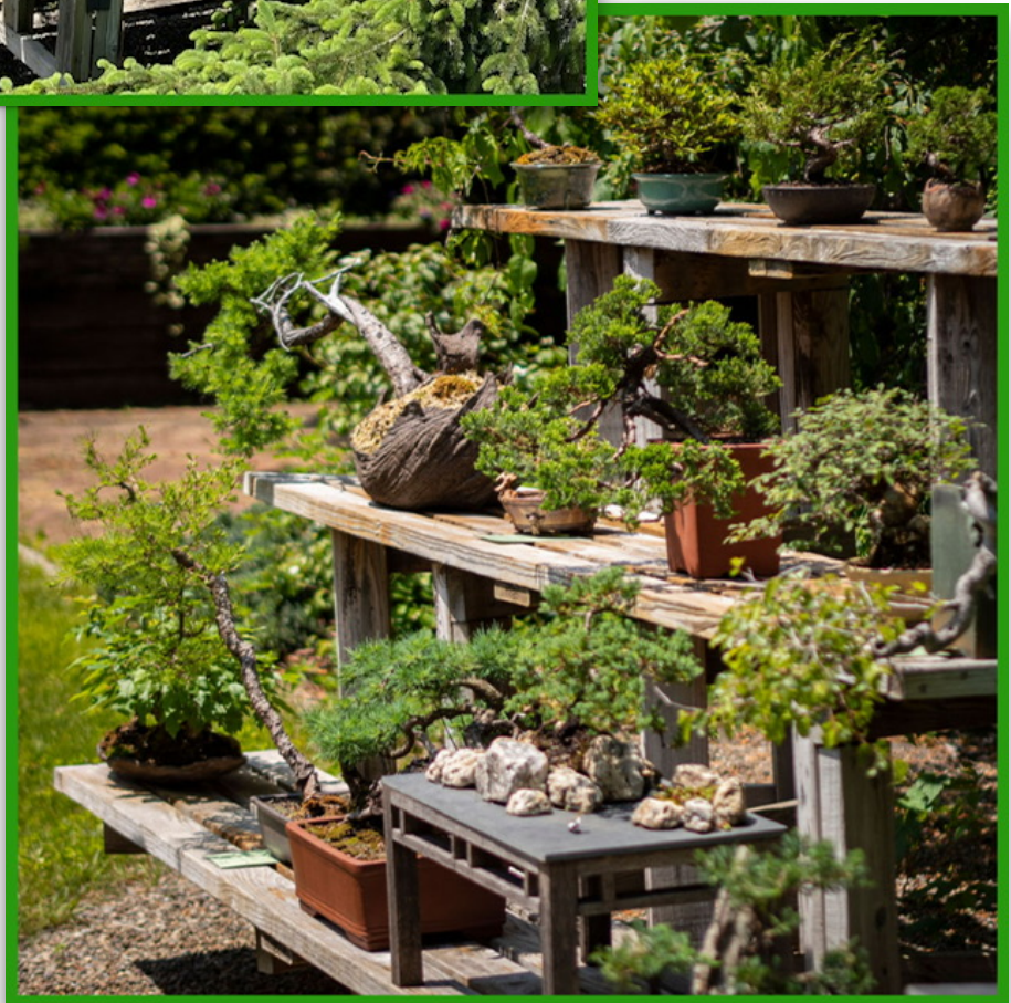
How wonderful it was to see Pauline's bonsai garden back in full splendor! Club members filled her garden, bringing back many of Pauline's trees to display as well as other trees that Pauline began, inspired, or assisted with.