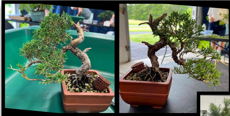
Mette Harder's Juniper