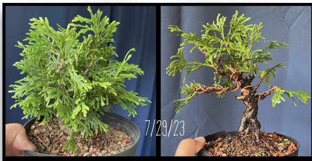
Nancy Castillo's Eastern White Cedar