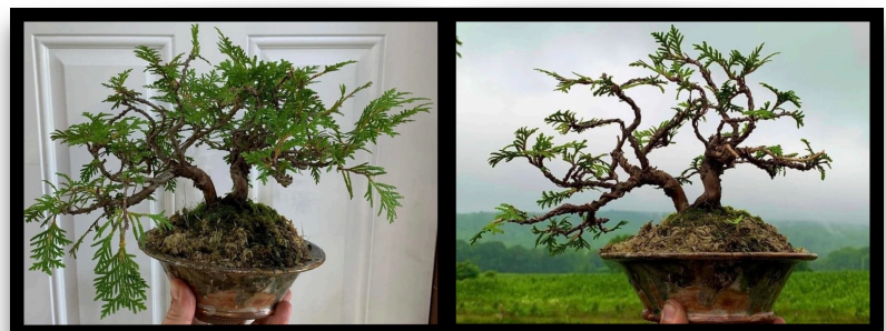
Brandon Herwick's Eastern White Cedar

Before & After images of trees from Mark's workshop.