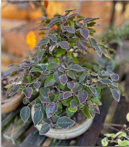
Korean Hornbeam bordered in frost after the first freeze of the season, October 31.

Clean and put all hardy trees into protected storage. Extremely hardy trees like larches can be tucked until evergreens for winter storage. Be sure trees are well watered before they freeze. Do major work on pines.