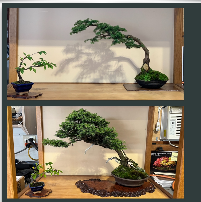
A sampling of spruces from Mark's collection. Red Spruce, Dwarf Sitka Spruce, Ezo Spruce, and Birds Nest Spruces