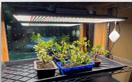
We'll talk about fall tree care at our BYOT workshop.

Hope to see you in two weeks. Bring some friends!