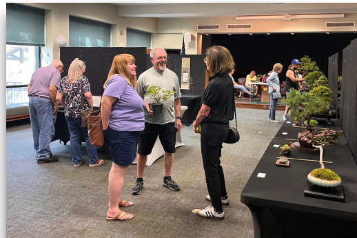
Visitors enjoying their time at the show