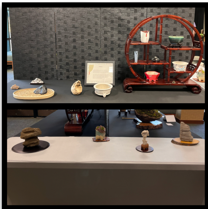
Contributors to the Pottery and Suiseki displays