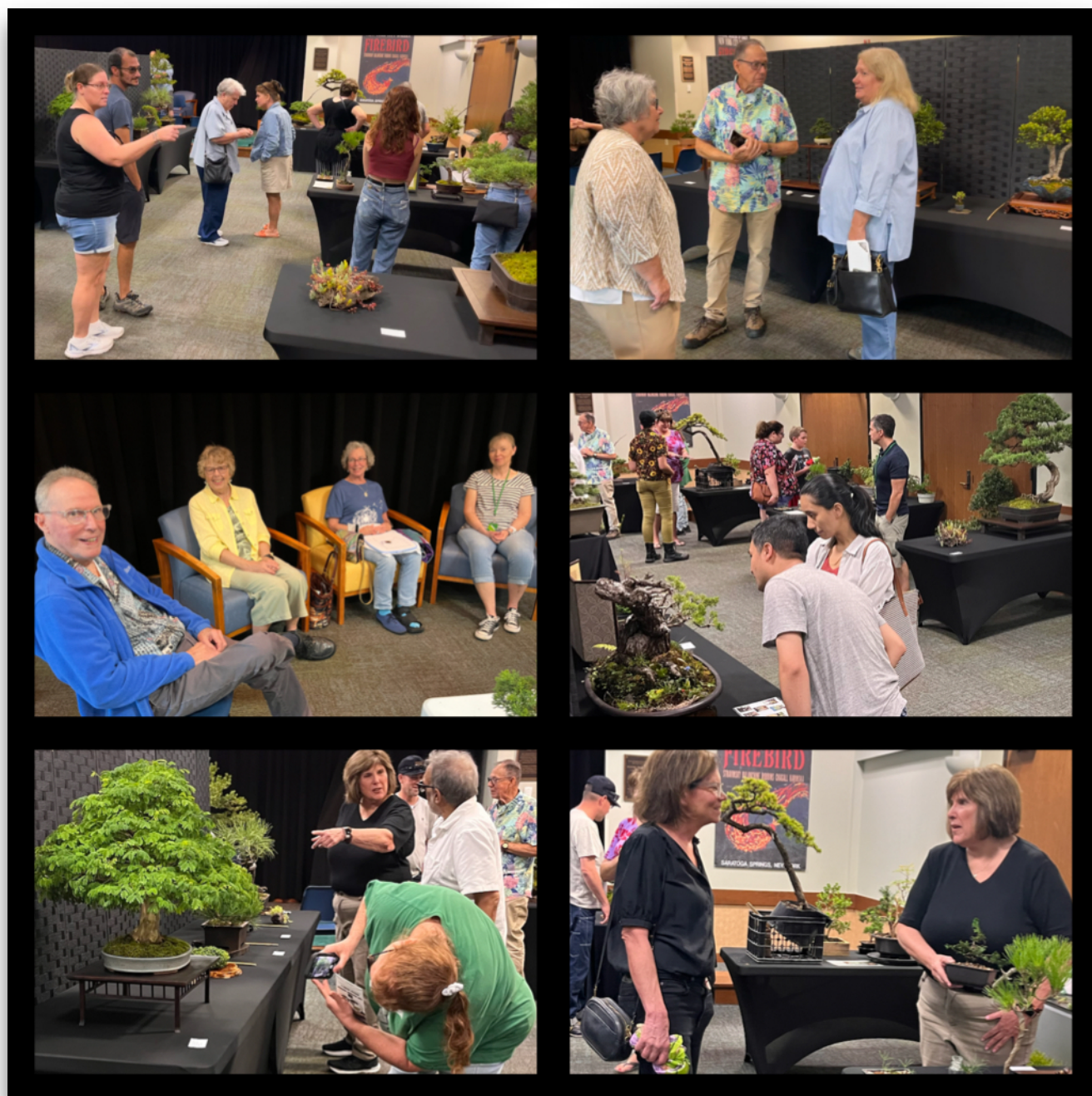
Scenes from the show & exhibition floor