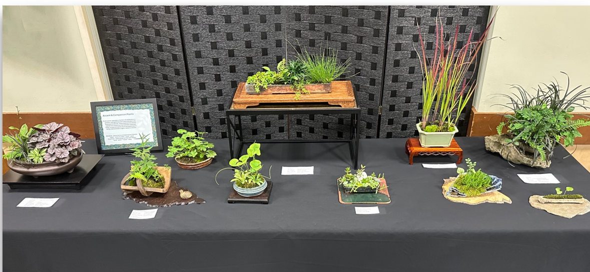
Contributors to the Accent & Companion Plant display