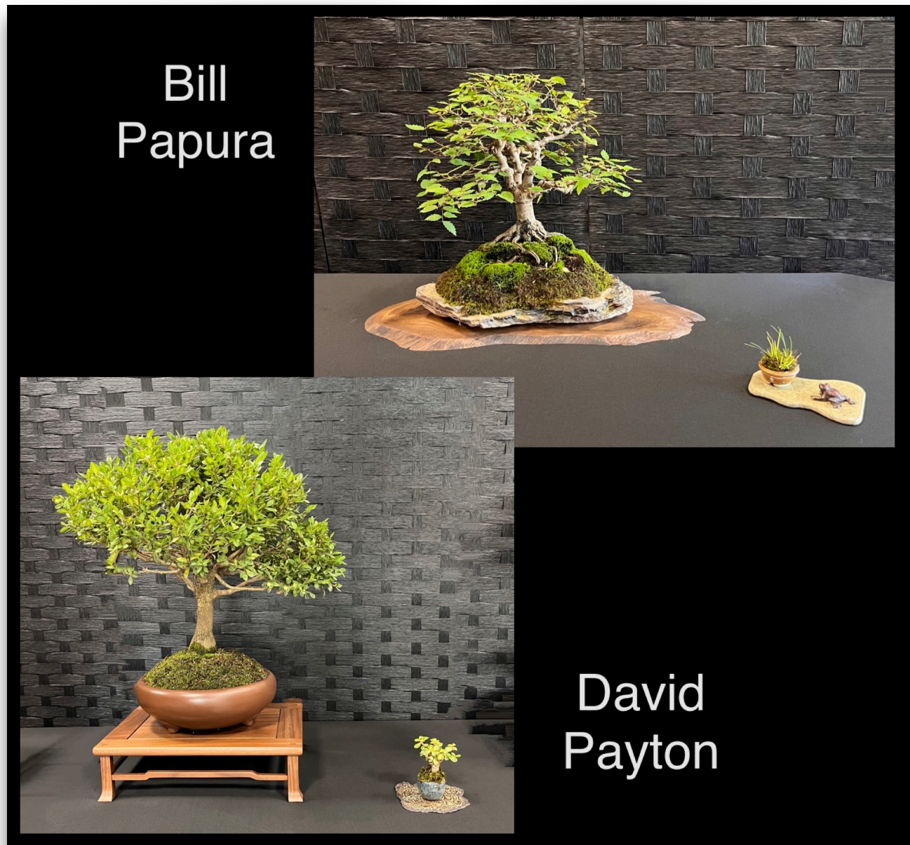
Top: Japanese Elm Bottom: Boxwood

As you admire the bonsai trees on these pages, we encourage all club members to take some time now to mentally (or physically) walk through your collection to earmark trees that could be exhibited in our 2025 club exhibition (and perhaps for the MABS exhibition in April 2025 as well) .