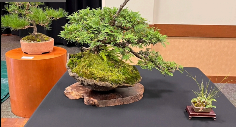
Top: Juniper Bottom: Eastern White Cedar