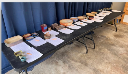
Bonsai pots from September's silent auction

Bring a luncheon item to share for our brunch. You can bring bonsai material, cuttings, pots, etc. for the sale table. 20% of the sale proceeds will benefit the club.